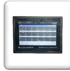
Touch screen control